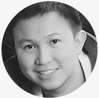
Punky Duero CRYPTO